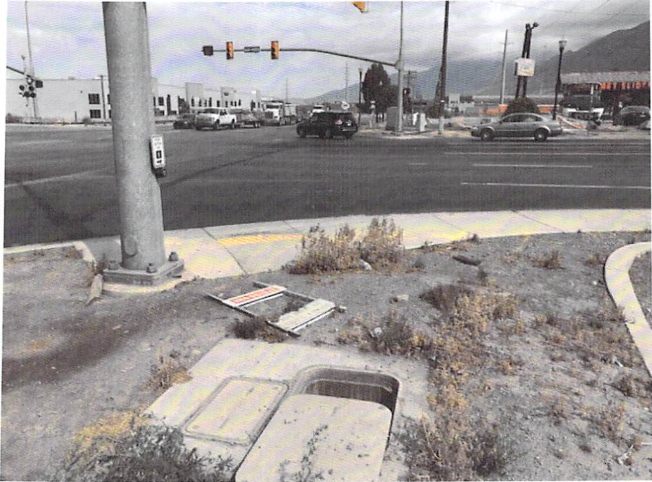
NE location of handhole